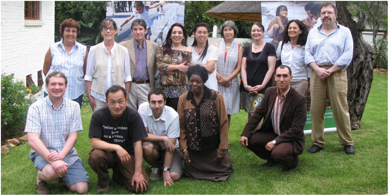
▼ (Clockwise from top left) Consultations in Nairobi, Mumbai, Johannesburg, Bangkok and Beirut